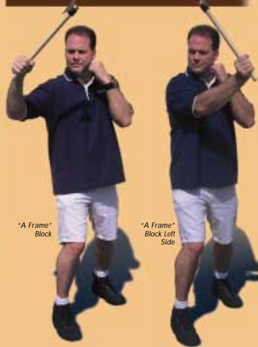
"A Frame" Block