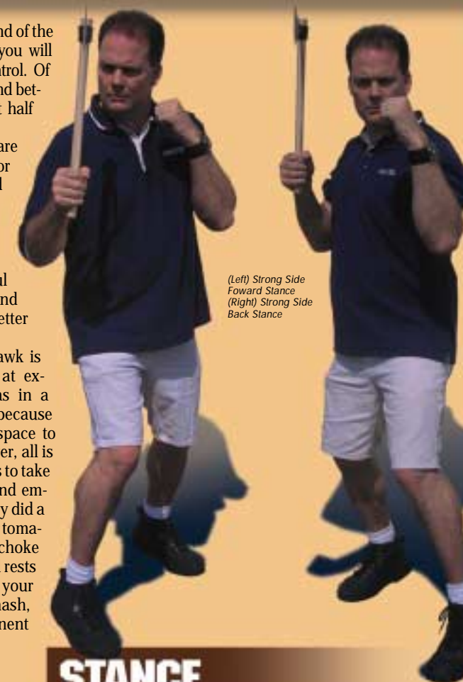
(Left) Strong Side Forward Stance (Right) Strong Side Back Stance

To assume this stance, take up a basic boxing position with your right hand forward (to you right-handed boxers, this is a southpaw stance). Grasp your tomahawk in a hammer grip near the bottom of the handle and extend it straight from the shoulder until your upper arm and lower arm form an L shape. Your gripping or strong hand should now be close to level with your right pectoral muscle, and your tomahawk blade will be about level with the top of your head. Make sure your weak shoulder is pulled back well to the rear. This will help in aligning your body so it presents a narrower target to the enemy. Also, remember to keep your left elbow in close and