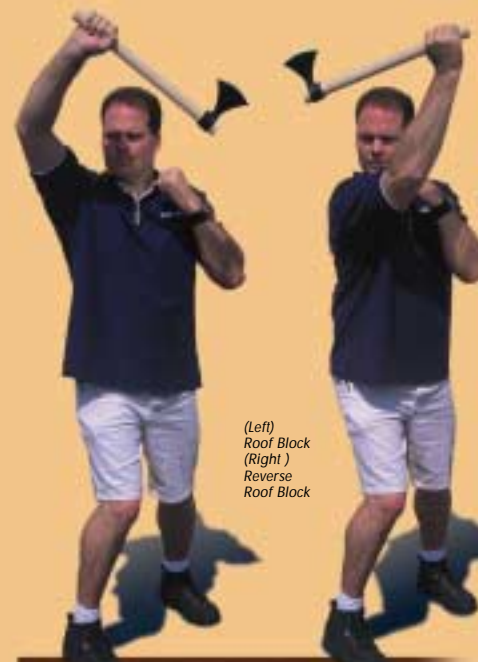
(Left) Roof Block (Right) Reverse Roof Block