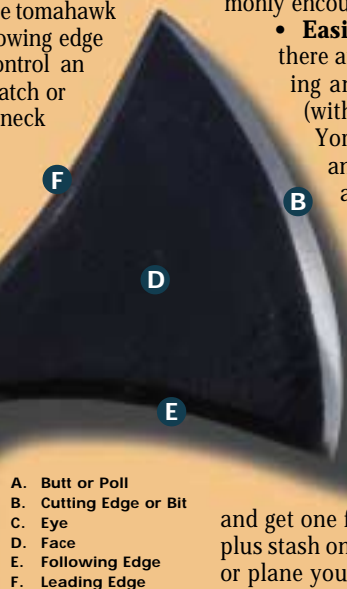
A. Butt or Poll B. Cutting Edge or Bit C. Eye D. Face E. Following Edge F. Leading Edge

• Better Offense - The strong side forward stance will improve your offense for two reasons. One is obvious. This stance dramatically increases your reach when compared to the weak side forward stance. The other reason may be a little more elusive until you have spent a few hours sparring. But, after you have a little